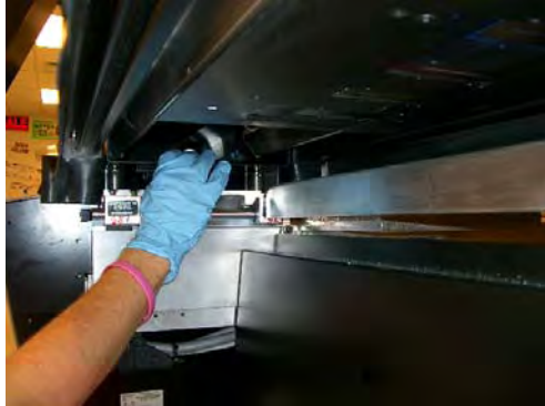
Left side plate between waste tray and table