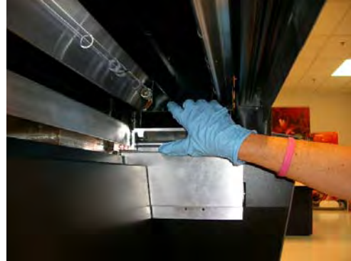
Right side plate