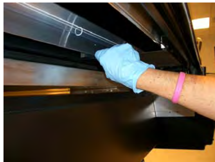
Sliding UV Shield